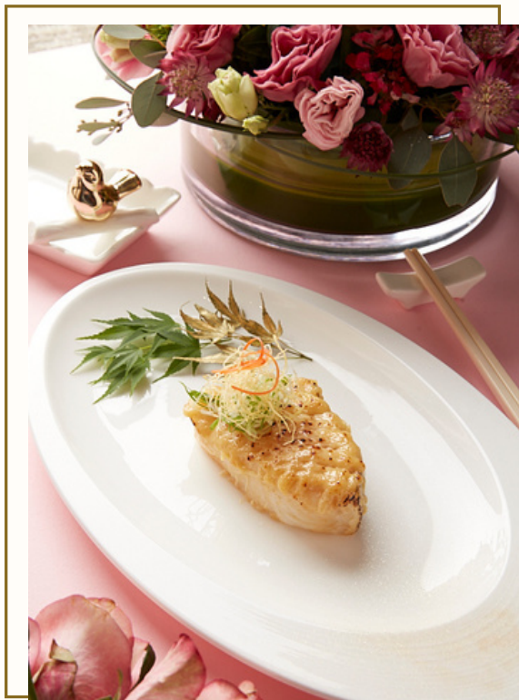
Oven Baked Cod Fillet with Japanese Miso