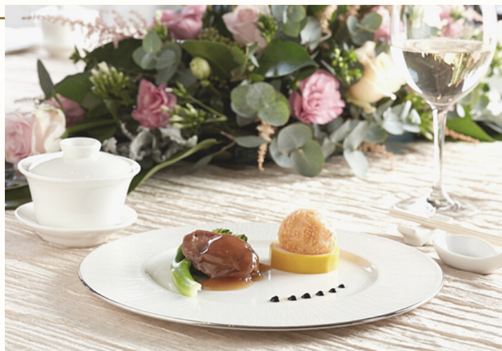
Braised 5-head Abalone with Jade Melon Ring and Shrimp Pearl