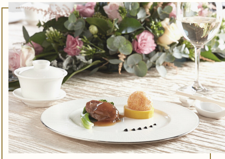
Braised 5-head Abalone with Jade Melon Ring and Shrimp Pearl