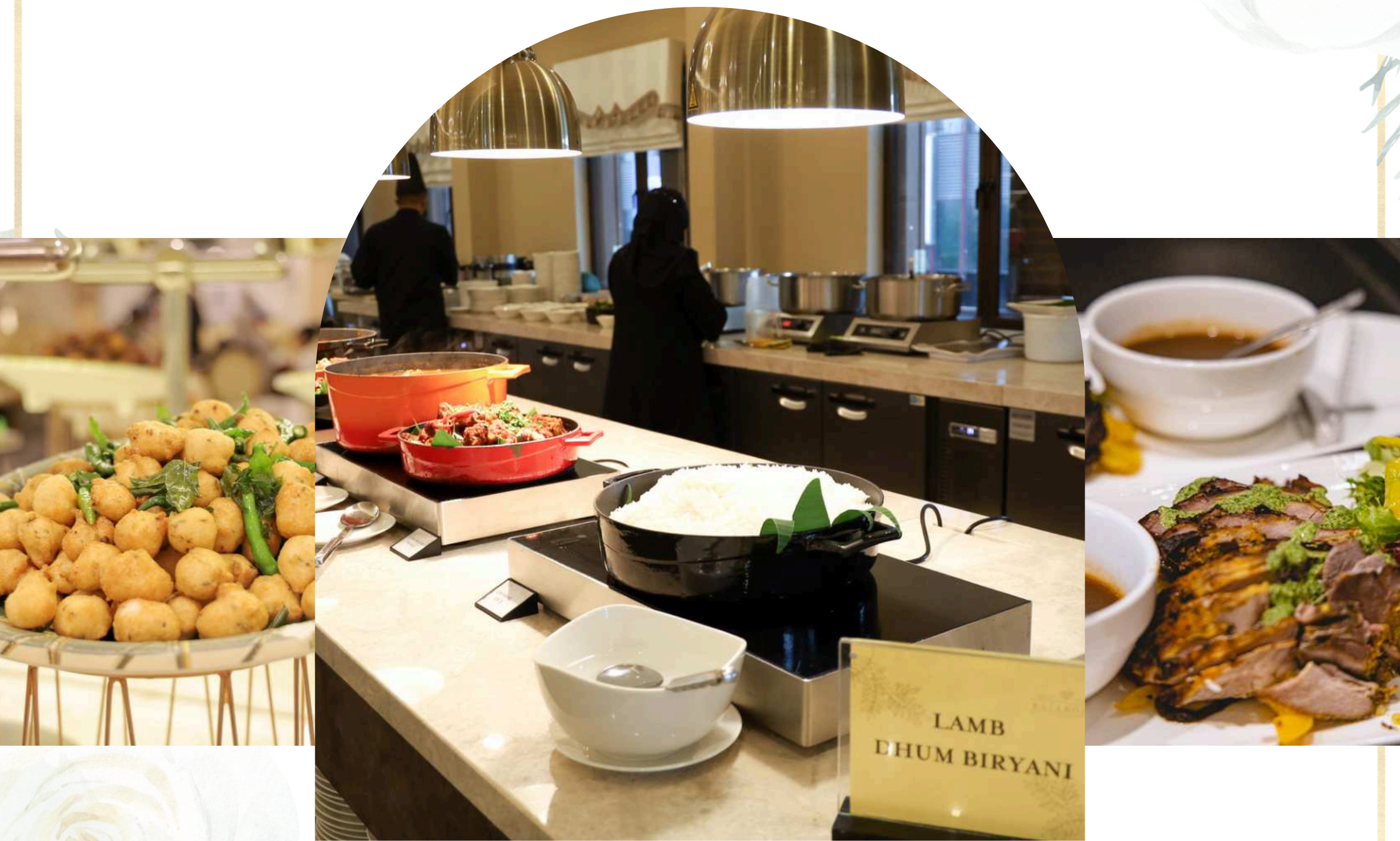
LAMB DHUM BIRYANI